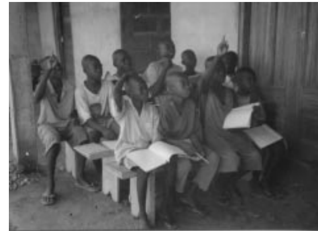
Left: The children participate actively in their after school classes with a local teacher. Their teachers have commended the boys for adjusting so well to their new school.