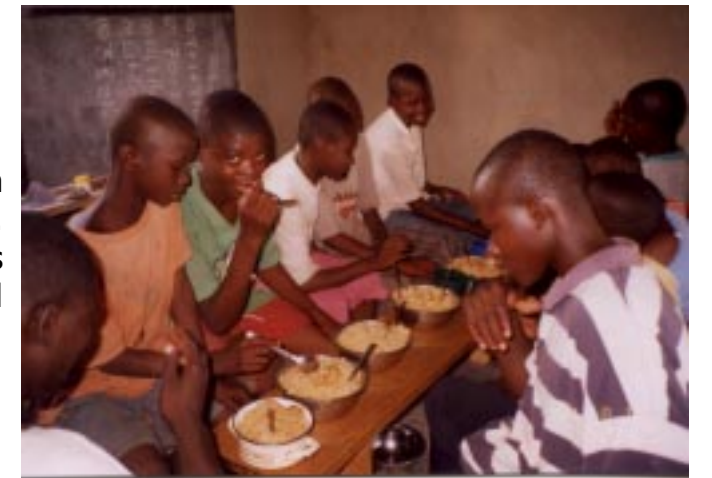
Right: The family shares an evening meal together. Mealtimes are always occasions for good fun and lively conversation.